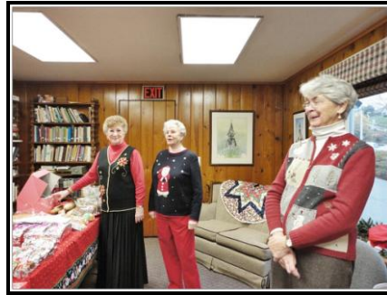
Parson's Pantry is Ready!