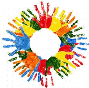
A Helping Hand Can Change the World

St. John's parishioners generously shared this Christmas season in many ways with our community at large. Thank you to all who participated!!