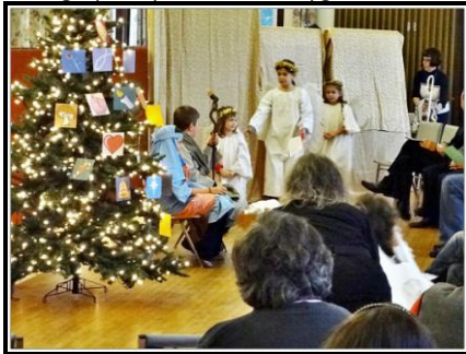
The Angels Appear to Mary & Joseph