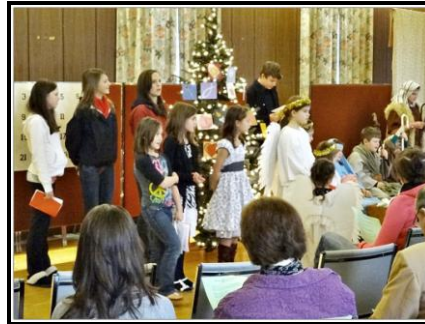
Narrators & Cast Sing Final Song