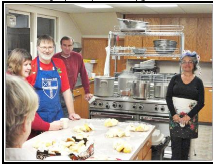
Kitchen Crew at Work