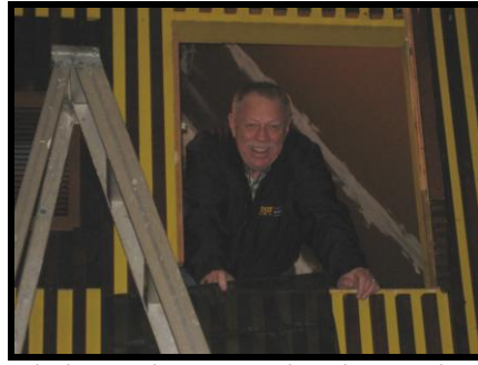
Checking out the Furnace.