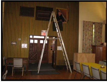
Preparing for April 1, 2010 Agape Dinner...