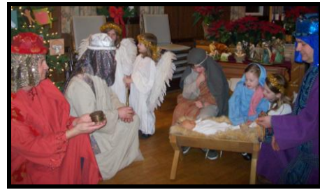
Wise Men Offer their Gifts.

Close to 90 parishioners gathered on Saturday, January 7 th , to celebrate Epiphany and the conclusion of the Christmas season. Children participated in a “living nativity” and three special Wise Men presented their gifts. We sang and shared an Epiphany cake, with its tokens inside.