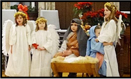
The Angels and Holy Family.